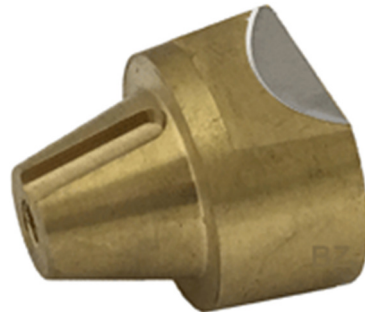
Once the Brass Nut is tightened onto the propeller shaft, bend up the tabs on the locking ring to secure the Brass Nut.