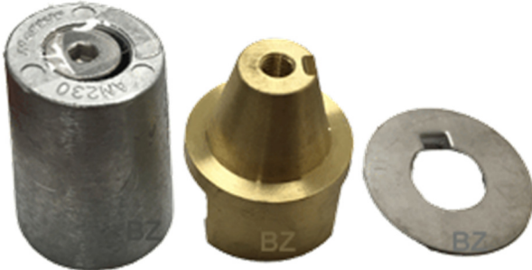
Shown: Beneteau Zinc Propeller Anode, Brass Nut and Locking Washer