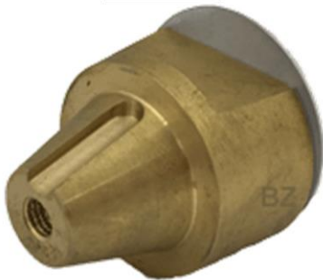
Thread Brass Nut onto Propeller Shaft.