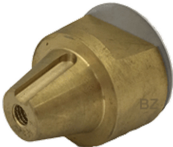
Thread Brass Nut onto Propeller Shaft.