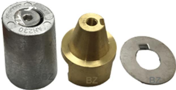
Shown: Beneteau Zinc Propeller Anode, Brass Nut and Locking Washer