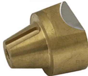
Once the Brass Nut is tightened onto the propeller shaft, bend up the tabs on the locking ring to secure the Brass Nut.